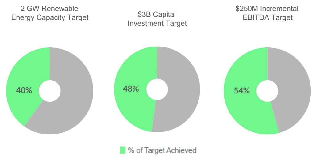
As of Aug. 4, 2022, we have made significant progress in achieving the targets of the Clean Electricity Growth Plan.

On Sept. 28, 2021, the Company announced the strategic targets and a five-year Clean Electricity Growth Plan that sets a focus towards investing in clean energy solutions that meet the needs of our industrial and corporate customers and communities. The Clean Electricity Growth Plan will largely be funded from current cash balances, cash generated from operations and asset-level financing.